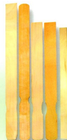
Stirring Stick: any size and shape