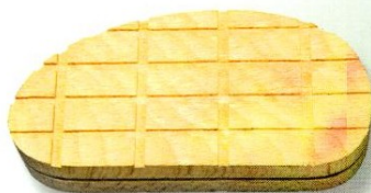
Wood Hoof: 110×52×23 mm