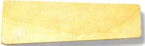
Rice Cake Handle: 77×26/21×2 mm