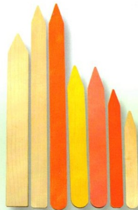
Fence: any size