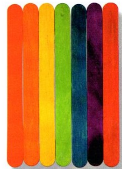
Counting Stick: 114×10×2 mm