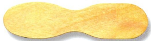
Medical Spoon: 77×21/13×1.5 mm