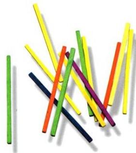
Color Match Stick: 50×2×2 mm